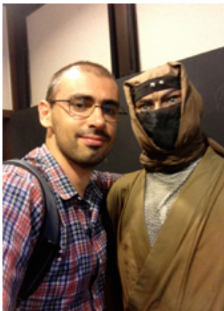
Selfie time with a ninja mannequin at the Ninja Reference Library (2013) within the Azuchi Momoyama Bunkamura, a theme park also known as Edo Wonderland in Ise. Ise is located in Japan's Mie Prefecture, a place that once included the historical region of Iga Province, where the ancient ninja were active between the 15th and 17th centuries.

Of course, things didn't go as planned. After all, I realized that I had actually upheld an impossibly ridiculous goal and I didn't even have a driver's license